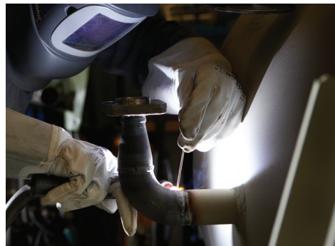
The Focus TIG 200 DC HP PFC welds mild and stainless steels and other DC-weldable materials

Focus TIG 200 DC HP is supplied with MIGA Super Blue tungsten electrodes, with excellent ignition and reignition properties, applicable for all types of material.