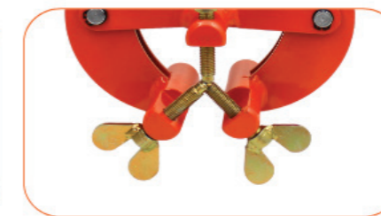
Smooth Roller Clamp