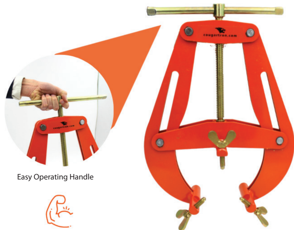
Easy Operating Handle

The T-handle ensures a seamless and effortless rotation