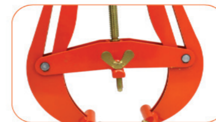
Two Wide Grip Plates

For secure and rapid alignment and assembly